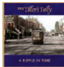
A Ripple in Time