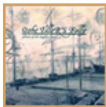
Ghosts of the Mighty Fraser