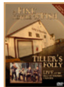
A Fine Kettle of Fish